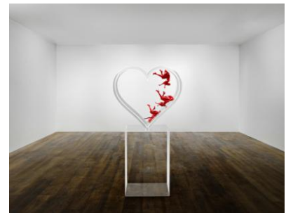
David Drebin (B. 1970 - ) Falling in Love , 2015 Photo Sculpture, 76 x 40 x 24 inches