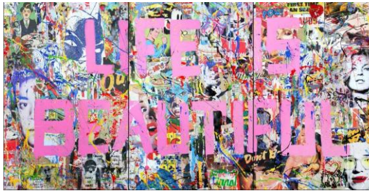
Mr. Brainwash (B. 1966 - ) Life is Beautiful Mural , 2015 Mixed Media on Canvas, 72 x 144 inches

Contessa Gallery looks forward to hosting a separate booth entirely dedicated to Mr. Brainwash's works. The artist himself will design the booth, and it is sure to be a blockbuster attraction at Art Miami. Mr. Brainwash (born Thierry Guetta in 1966) began his artistic career over 16 years ago documenting the underground world of street artists. Eventually this endeavor introduced him to Banksy, who is arguably the most anonymous and famous street artist living today. With the encouragement of Banksy, Guetta began creating his own street art. In 2008, Mr. Brainwash produced an explosive first solo show, Life is