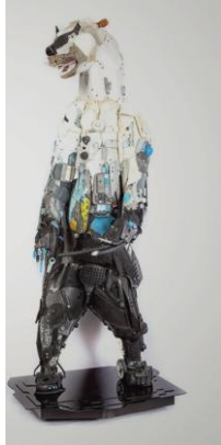
Gilles Cenazandotti (B. 1966 - )